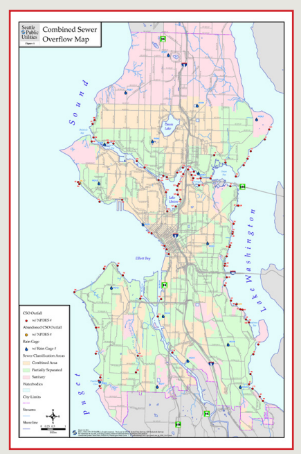
CSO Basins in Seattle, WA

"We previously thought we were overflowing between 300-400 million gallons per year (on average), and that number dropped down to 100-200 million gallons per year (on average) since we improved our monitoring... It's definitely a big savings."