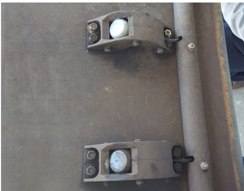
7618 Transducers Mounted on Plate

The 7618's are usually mounted in arrays with integral conduit protection