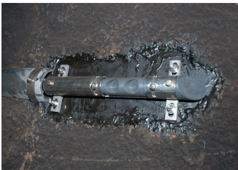
7634 Transducer Mounted in Concrete Pipe