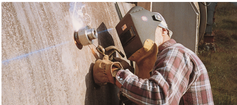
Model 7664 Weld-on Cold Tap Installation