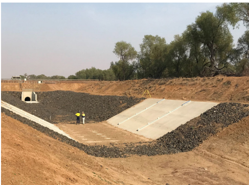
7612 Transducers Installed in Trapezoidal Channel