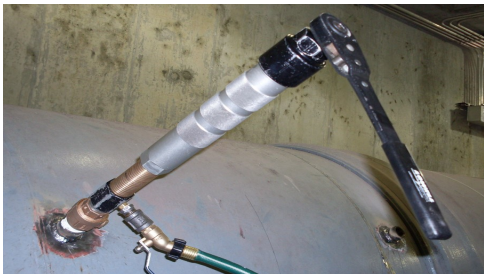
Model 7647 Corp-stop Hot Tap Installation