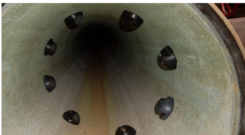
7625 Transducers Installation - Internal View