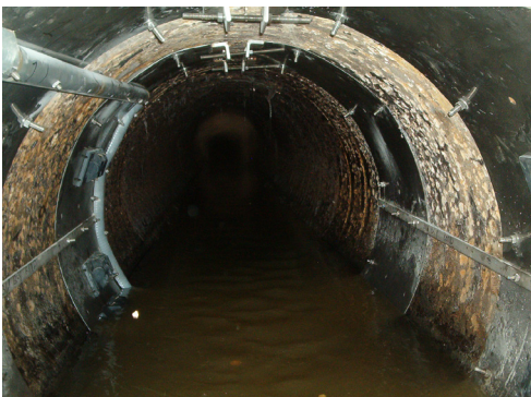
7658 Transducers Mounted on Stainless Steel Band

7658 is also well suited for non-hazardous locations where low profile mounts are desirable