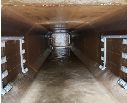
7658 Transducers Installed in Octagon Conduit