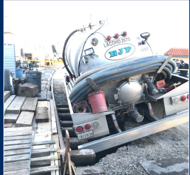
Parked truck partially fallen in sinkhole alongside railroad tracks.

Learn more about the ECHO at www.adsenv.com/echo