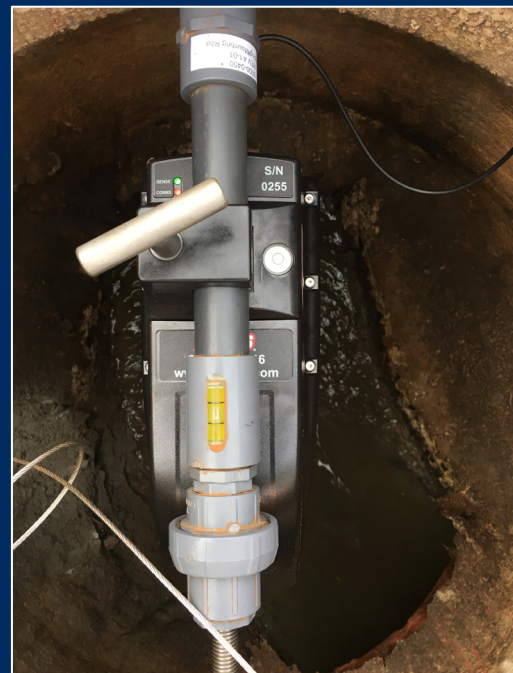
ADS ECHO installed on an adjustable mounting bar in the manhole site immediately upstream of the sinkhole.