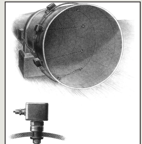
Typical 4-path installation of Model 7605/7625 Feedthrough Transducers

The Model 7625 is the same design as the 7605 with the exception that the transducer body material is made from Delrin®. The transducer is offered for applications where cost is an important factor. The Model 7625 is used in medium pressure applications where the transducer is not directly exposed to the outdoors.