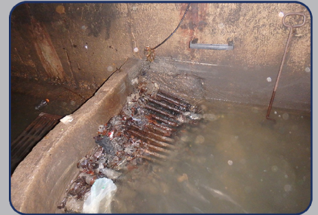
Simms Interceptor Structure St. Louis, MO (MH 21K3-0021C)

The "Simms Interceptor", shown in the photo to the right, is an example of this practice. When major projects are underway, the Simms Interceptor and other weir walls, dry-weather diversion pipes, and interceptor grates must be monitored and maintained to avoid dry-weather overflows due to clogging of the grates and pipes.