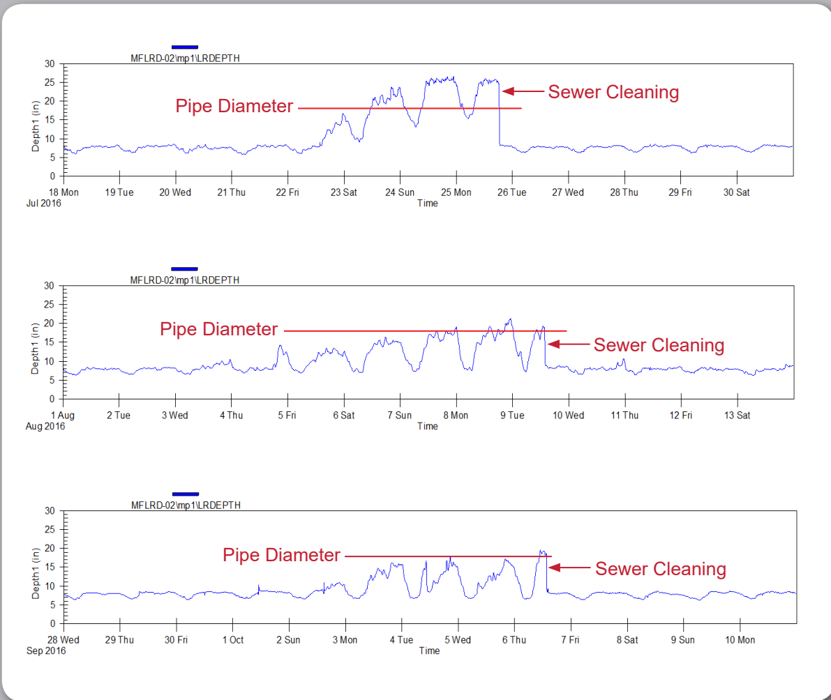
Three Developing Blockages in Murfreesboro, TN

Let's take a closer look at the observed blockages on the graphs below. While all three developing blockages were characterized by a gradual increase in the maximum daily flow depth, note that the first developing blockage differs from the second and third blockage in one important way. The minimum flow depth shows a gradual increase in the first developing blockage, but not in the second and third. ADS has found that the gradual increase in the maximum daily flow depth indicates the presence of a developing blockage, while the increase or lack of increase in the minimum daily flow depth provides information about the type of developing blockage. In this case, the first blockage was caused by debris accumulation in the invert of the sewer, while the second and third blockages were caused by grease accumulation on the pipe wall near the wastewater flow surface.